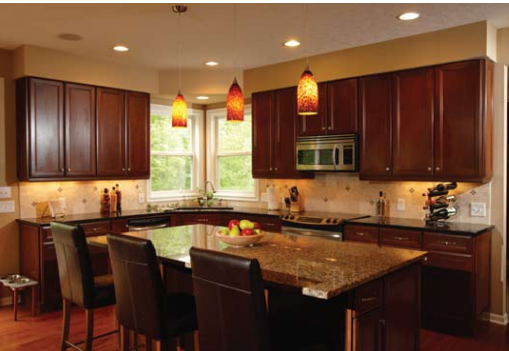
The kitchen includes an enlarged island with a tan and black granite countertop, cherry cabinets and tall ceilings.