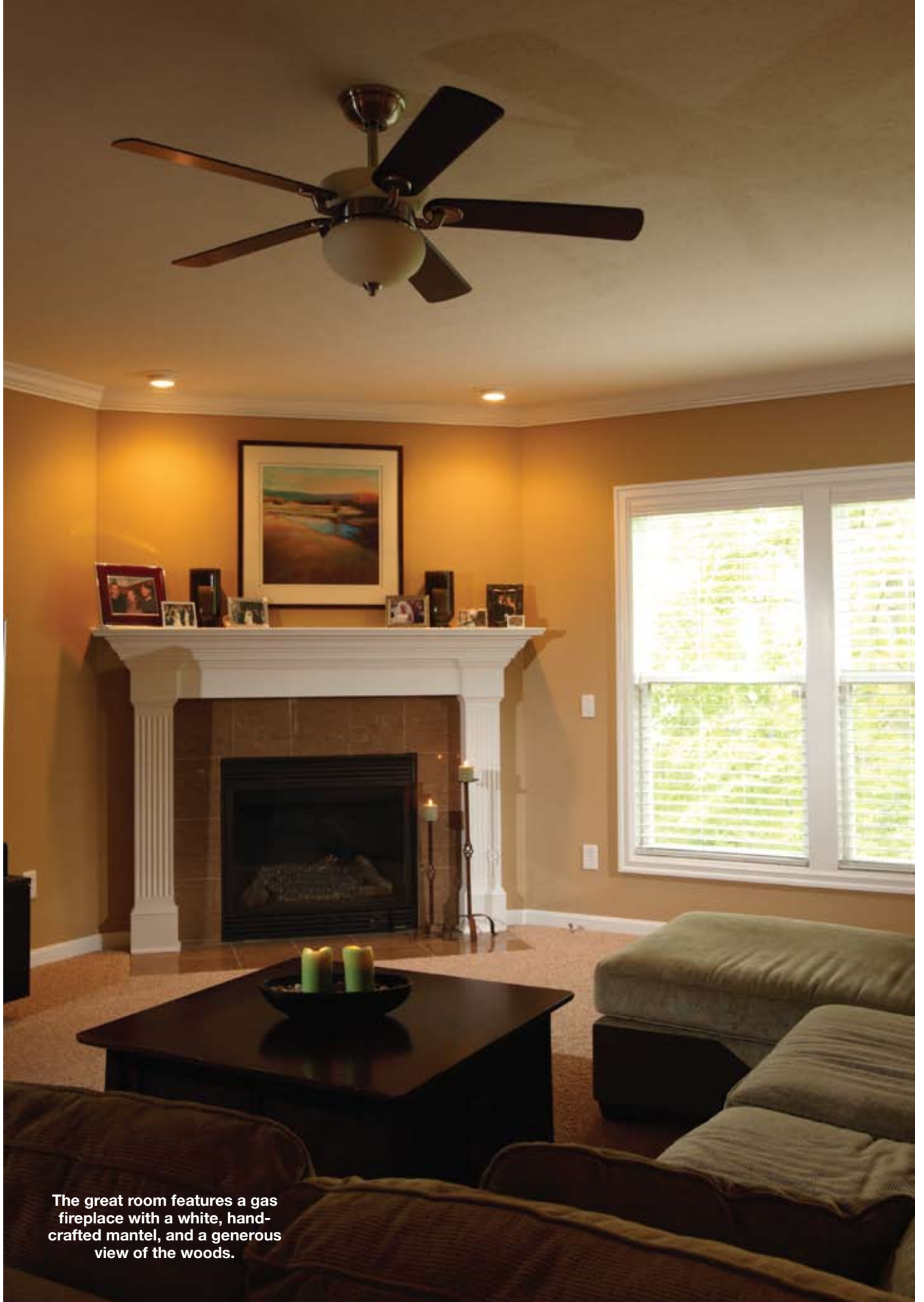
The great room features a gas fireplace with a white, hand-crafted mantel, and a generous view of the woods.