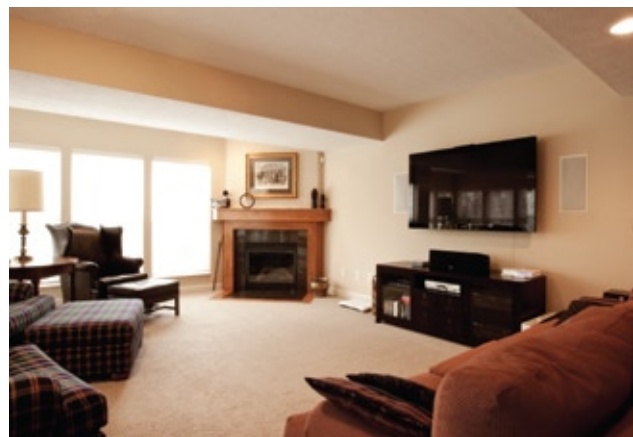
The finished lower level includes an entertainment area, kitchenette and 11 windows overlooking a deck.

As they contemplated moving, "We thought the kids would be sad that their family home was being sold, but they