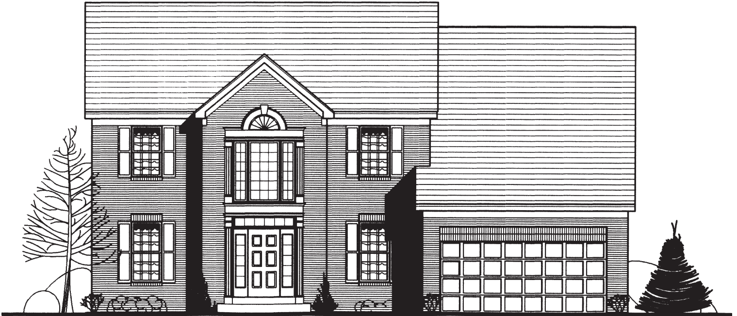
TRADITIONAL ELEVATION WITH OPTIONAL BRICK FRONT