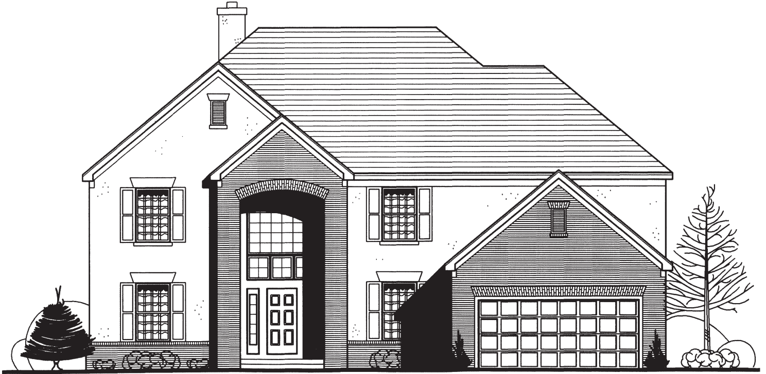
CLASSIC ELEVATION WITH OPTIONAL BRICK FRONT